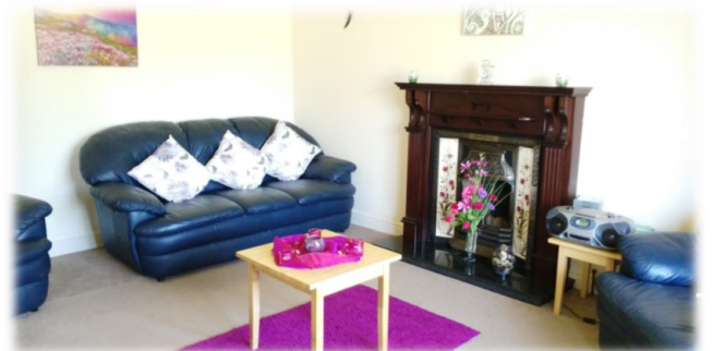
The Meditation room at the Carlow centre

In February 2015 the Irish Province opened a Meditation centre in Carlow town. The centre is open to all and offers guided prayer and meditation to people of all faiths and none. Visitors are also welcome to chat over a cuppa and to avail of the spiritual library service.