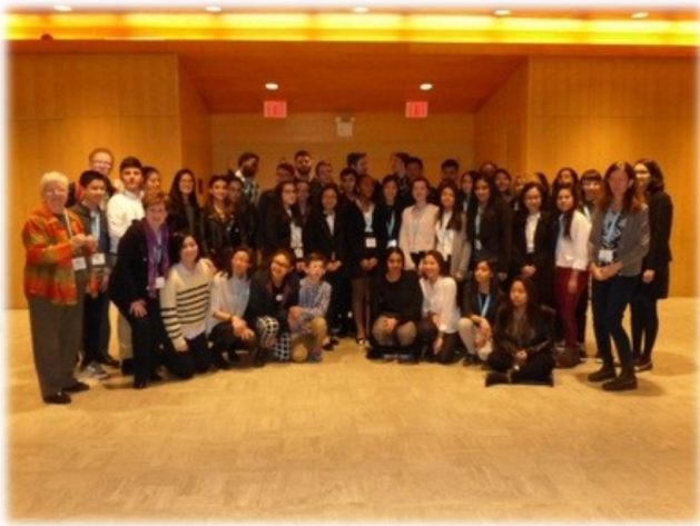
The whole group at the UN with the Canadian Ambassador

The annual United Nations excursion is popular among Toronto Catholic High School students and teachers. The motivation four years ago was to support the IBVM NGO at the UN by having students see, on-site, how the UN functions. The guided tour of UN Headquarters, visits to Government Missions and input sessions on structure, programmes and related bodies are very informational. Students gained deep appreciation for the UN, for multi-lateralism and the need of nations to work together for the common good.