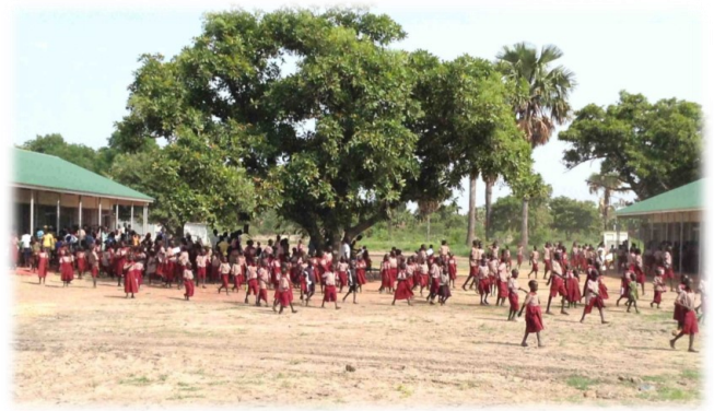
Pupils make their way to class after assembly

There are now 535 girls and boys in the school and 150 older children in afternoon school.