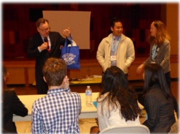
The Canadian Ambassador being thanked by student