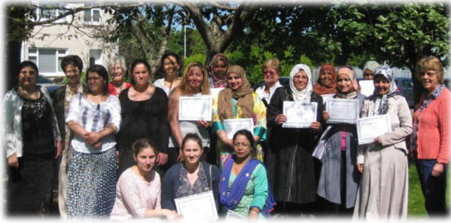
Presentation of Certificates May 2016