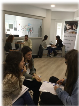
Volunteer workshop, Madrid

We see pre-departure training as vital, regardless of a person's experience. Two weekend long sessions are organized, and attendance is mandatory. Volunteers are provided with knowledge about their destination, the possible difficulties to be faced.