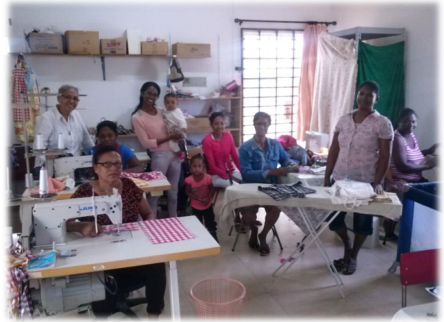
Some members of BMWA – 2016

Another dream is that women and families of Bois Marchand can strive to have a better future and contribute to a better world.