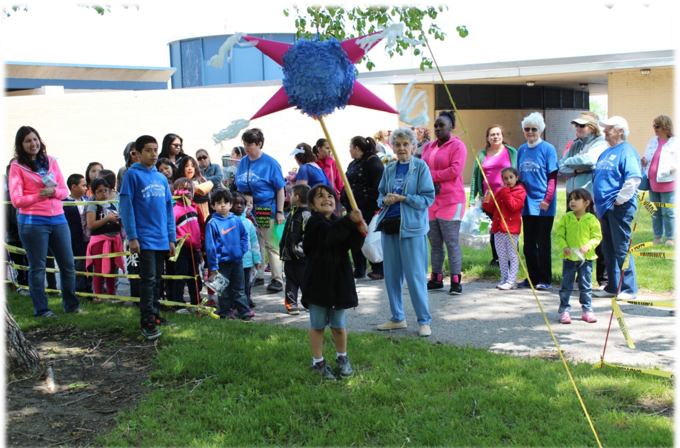
Mary Ward Center Chicago-Walkathon