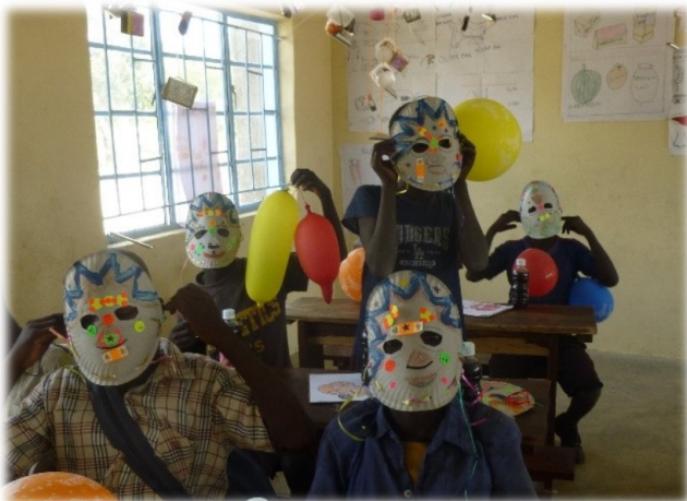
The children wearing their masks

One of these activity days was recently held at Chimbanda Community School near Lukulu. Sr Elizabeth worked closely with teachers to undertake creative activities in the classroom. These included colouring in pictures, dot-to-dot, lacing cards, weaving and making masks and mobiles. It is worth noting that these children have never seen crayons or colour-in