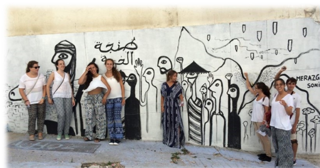
Intercultural Solidarity Experience Asilah, Morocco July 2015

https://www.youtube.com/watch?v=AnZdcO6n3c4